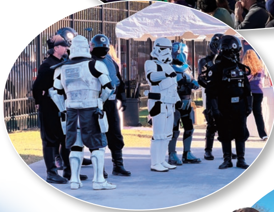
Everyone in the universe can get behind the efforts of the Alzheimer's Association!

Our Lady of Hope prepares every year to support the walk for Alzheimer's. This year presented a new venue location for our community, but the mission didn't change. Each year we proudly stand together to raise money and awareness to fight this terrible disease.