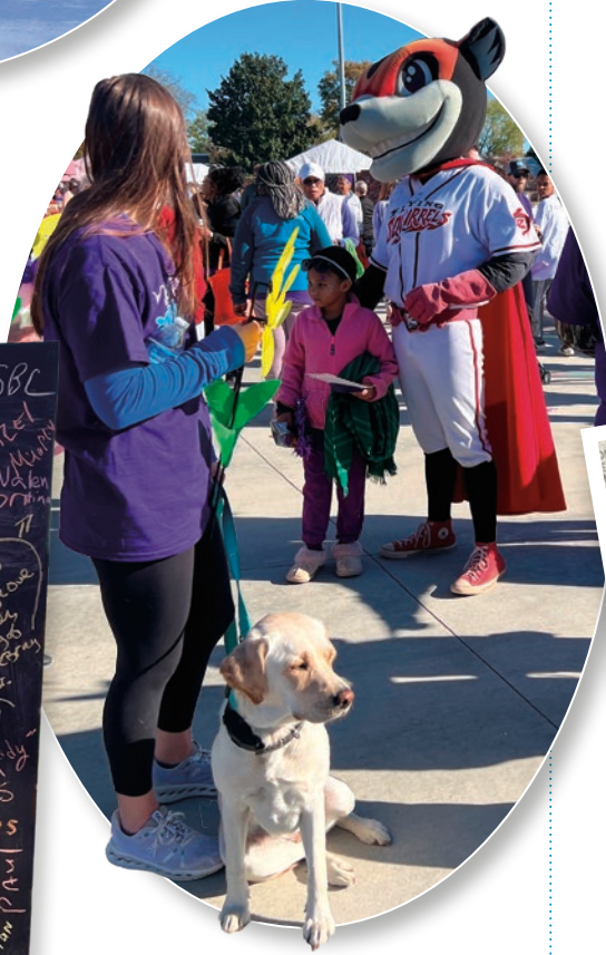
Even "Nutzy" the mascot was at the march showing support and greeting attendees with both two and four legs!