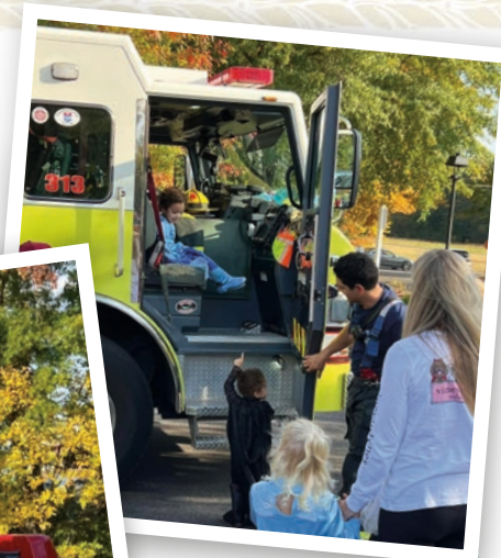
Kids and adults lined up for the chance to sit in the fire truck's front seat.